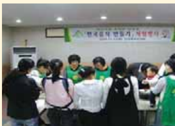
Sinseon-dong's Saemaul Women's Club hosted a

'Korean Food Making Event', which was to make Galbi jjim and Doenjang soup, for 32 Korean language class students at the Multipurpose room of the community center to inform Korean traditional culture and to help them to adjust into the local community.