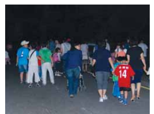
Research for habitat of lightning bug