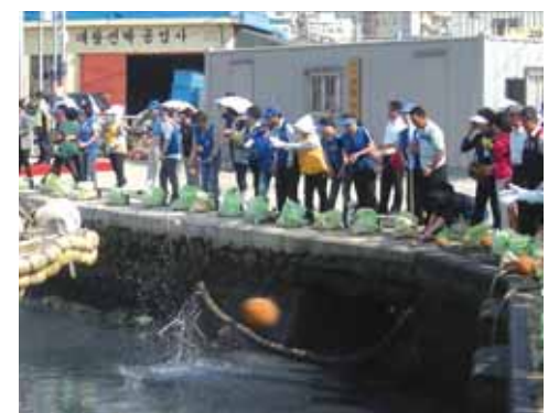
Throwing EM-soil balls into the seacoast in Namhangdong